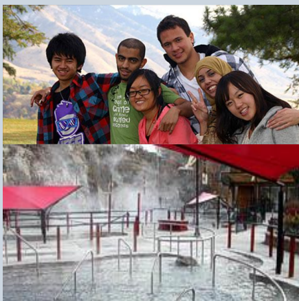
FIRST ANNUAL MINI SPRING BREAK, MARCH 2013

with friends, diversity, and fun became the priority for this event. A variety of morning workshops were facilitated on topics including "Cultural Communication," "Stress Management," and "Leadership." Lunch was provided and the gang took off to one of the area hot springs for an afternoon of soaking and conversation. Approximately, 35 students participated in the first event and we hope this is but one of many opportunities for students to connect and develop friendships that transcend all cultures.