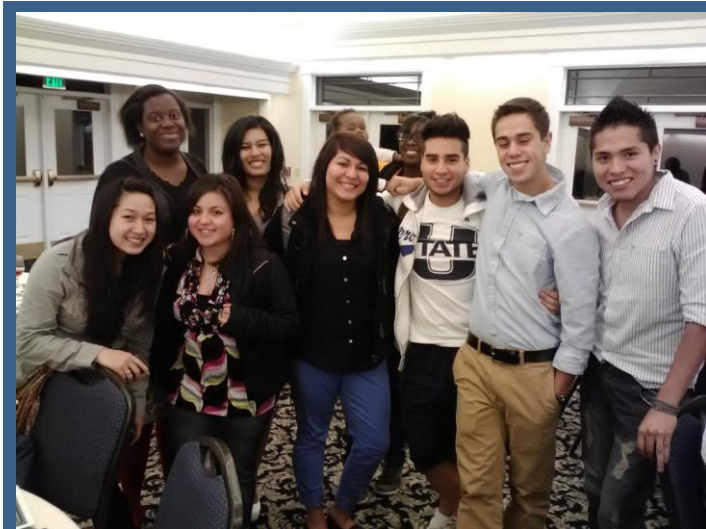
ACCESS & DIVERSITY CENTER SCHOLARSHIP RECIPIENTS, 2012-2013