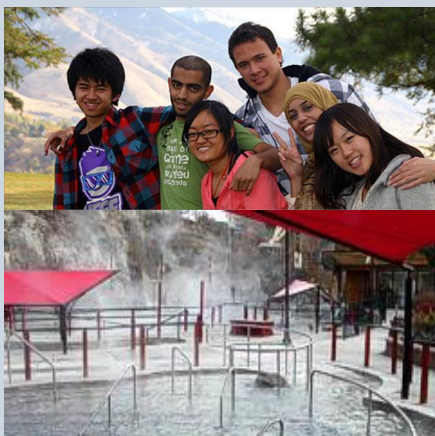
FIRST ANNUAL MINI SPRING BREAK, MARCH 2013

with friends, diversity, and fun became the priority for this event. A variety of morning workshops were facilitated on topics including "Cultural Communication," "Stress Management," and "Leadership." Lunch was provided and the gang took off to one of the area hot springs for an afternoon of soaking and conversation. Approximately, 35 students participated in the first event and we hope this is but one of many opportunities for students to connect and develop friendships that transcend all cultures.