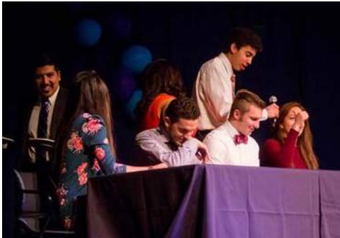
Contestants of the Jalapeño eating contest