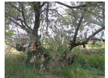
Shoshone prayer tree at Bear River Massacre site.