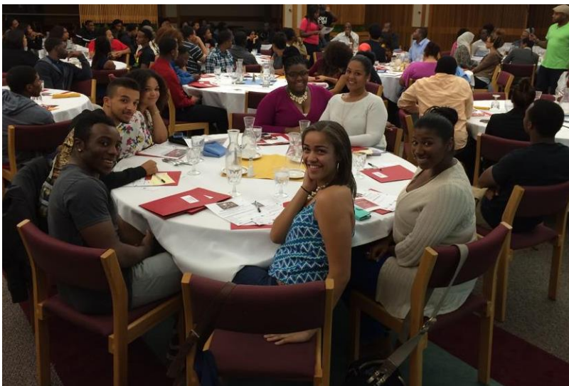
Students from the Black Student Union at the Expect the Great Conference in Salt Lake City, November 7 & 8

We were proud of the way our students represented us at the conference. It was no surprise to us when conference staff commented on the mature and professional way they conducted themselves. They really stood out as exceptional student attendees, and they had a great time participating. We will be delighted to provide this opportunity for our students again next year.